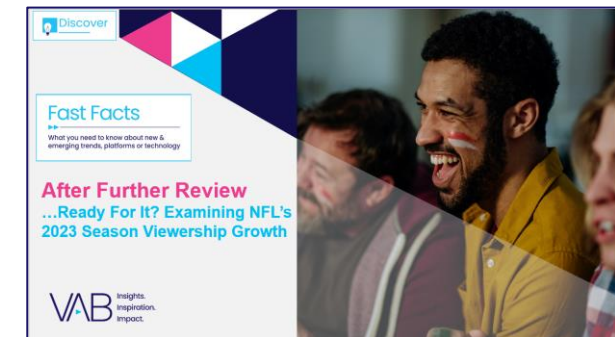
After Further Review ...Ready For It? Examining NFL's 2023 Season Viewership Growth