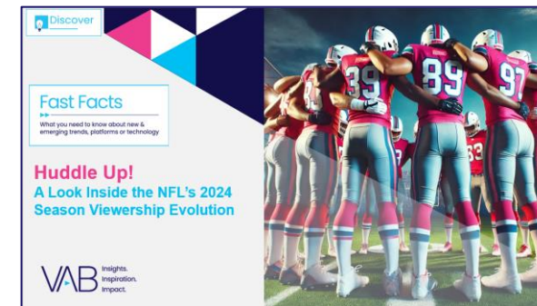
Huddle Up! A Look Inside the NFL's 2024 Season Viewership Evolution