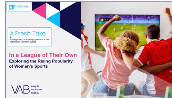
In a League of Their Own Exploring the Rising Popularity Of Women's Sports