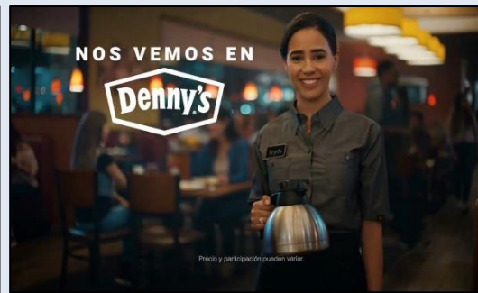
click image above to watch Spanish-language spot