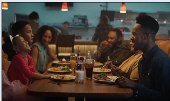
click image above to watch English-language spot

4-Month Campaign: 4/29/19 – 8/25/19 (Spanish-Language ad was extended through 2/17/20) 3,381 Airings / 574.7 MM HH IMPs