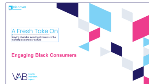
A Fresh Take On Engaging Black Consumers

VAB Members, brand marketers and agencies get free and immediate access to VAB's content library. Get access at theVAB.com