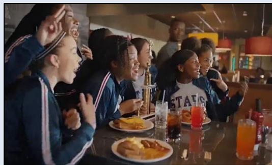
click image above to watch English-language spot