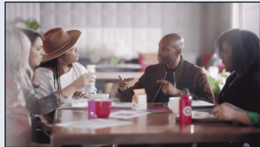
click banner above images to watch spot