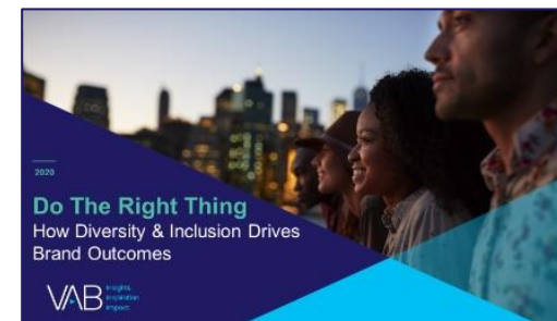
Do The Right Thing How Diversity & Inclusion Drives Brand Outcomes

We are committed to providing marketers with the data and insights they need to develop thoughtful, inclusive campaigns & strategies. To find out more on the unique media consumption behaviors and cultural trends of multicultural consumers, visit our Multicultural Marketing Resource Center .