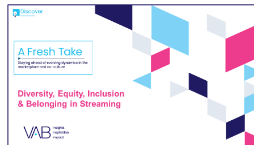
A Fresh Take Diversity, Equity, Inclusion & Belonging in Streaming