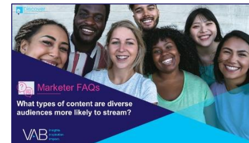
Marketer FAQs What types of content are diverse audiences more likely to stream?